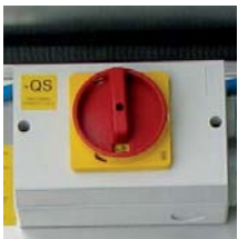
Safety switch. Power supply 50Hz or 60Hz.