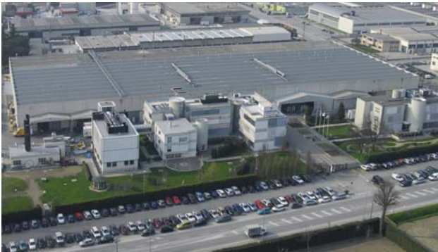
Emerson Network Power Headquarter EMEA

Emerson Network Power™ , a Division of Emerson, is a global company matching technology and design to supply innovative solutions for its customers' benefit.