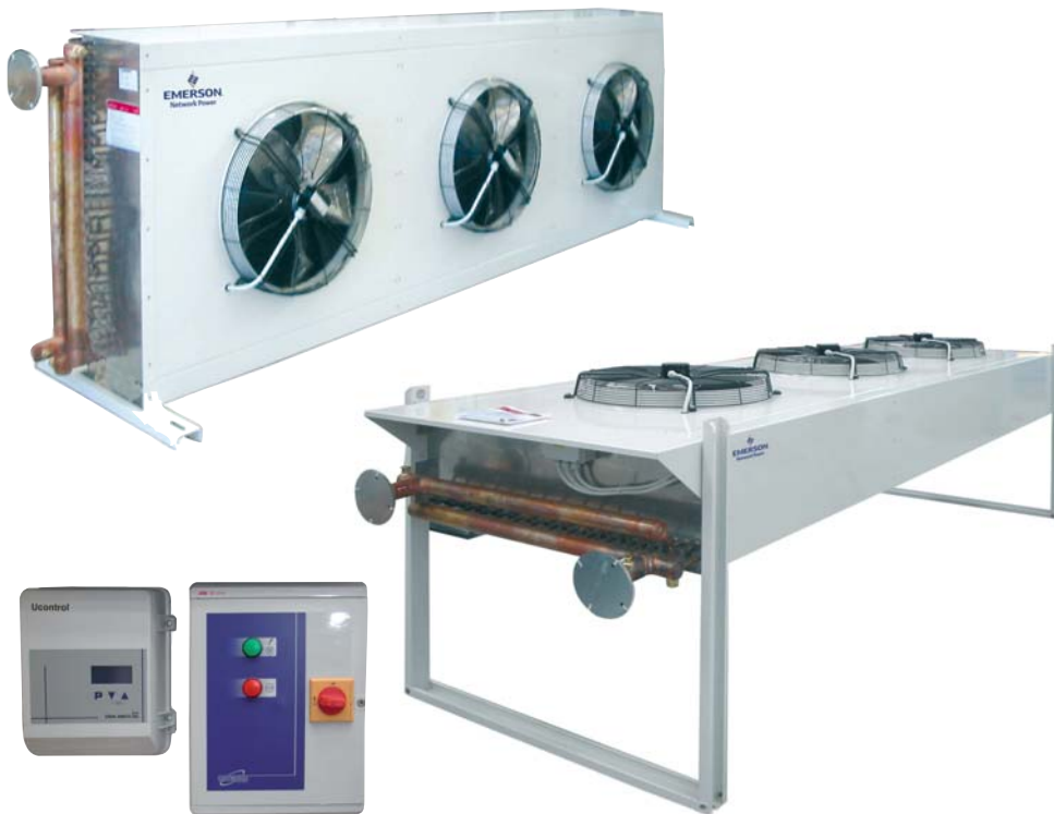
Electric Panel and fan speed control (Three phases Drycooler Modes)

The same Drycooler unit can be installed either Horizontally or Vertically, with simple operation to be done on site, thus reducing transportation and handling costs.