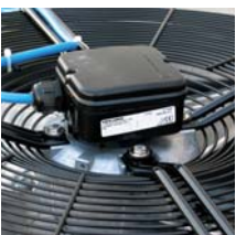
Silent axial fans. IP54 motors.