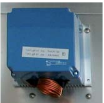
Modulating fan speed control. Silent function during the night.