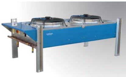
Legs can be used either for horizontal or vertical installation.