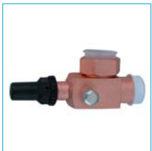
Service valves with pressure tap.